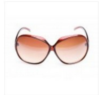
JACKIE O ROUND SUNGLASSES