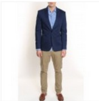
KHAKI BOWERY CHINO PANTS

WHY NOT SHARE YOUR PURCHASE TO TWITTER, FACEBOOK OR LINKEDIN?